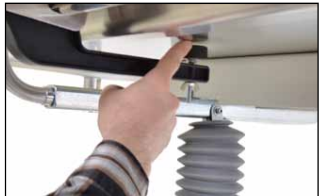
Figure 4 - Verify the Rubber Stopper is Firmly Resting Against the Bottom of the Embalming Table