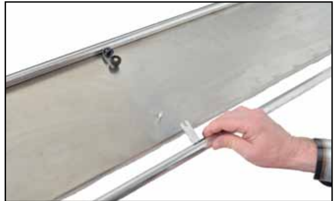
Figure 12 - Re-Attach the Tubes to the SEP