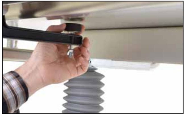
Figure 6 - Adjust the Rubber Stopper