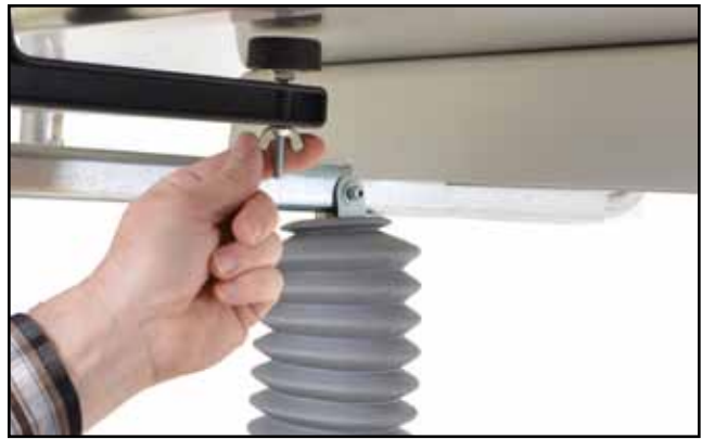
Figure 5 - Loosen the Wingnut