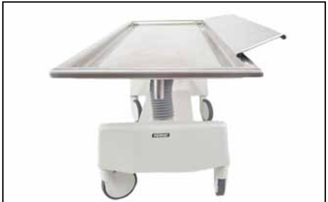
Figure 8 - SEP Attached to the Embalming Table