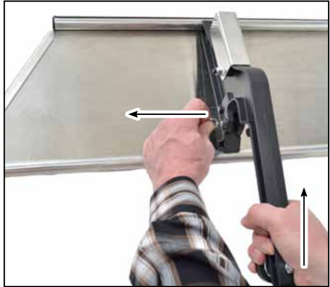
Figure 9 - Remove the Support Arm Assembly