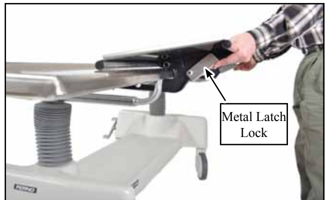
Figure 3 - Attach the SEP to the Embalming Table