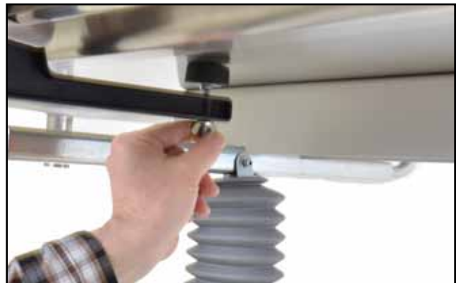
Figure 7 - Re-Tighten the Wingnut