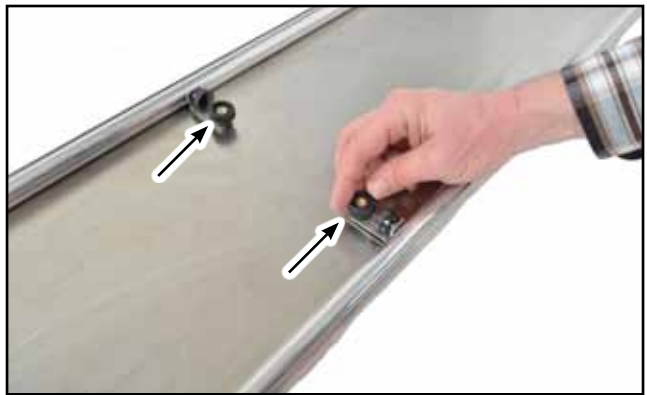
Figure 10 - Remove the Knobs on the SEP