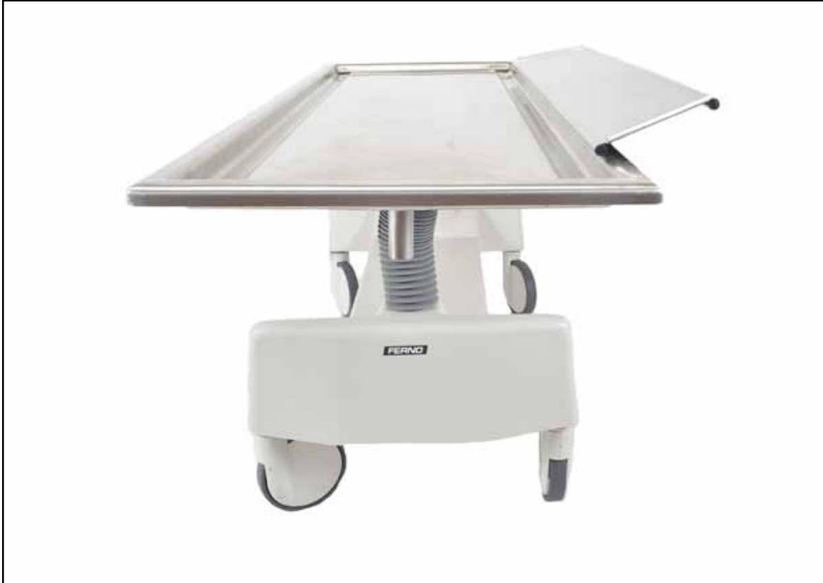
Kit 069-5796 Side Extension Panel