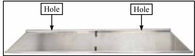
Figure 1 - Place SEP Bottom Side Up